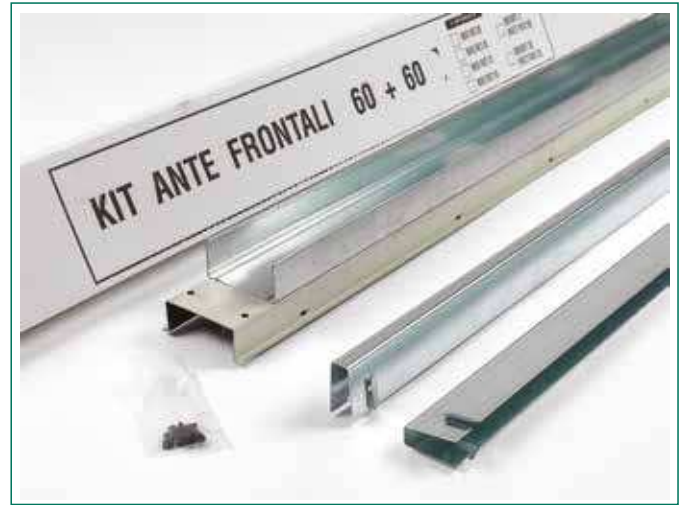
Version for drywall