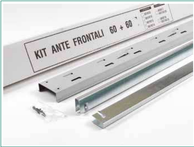
Version for plaster